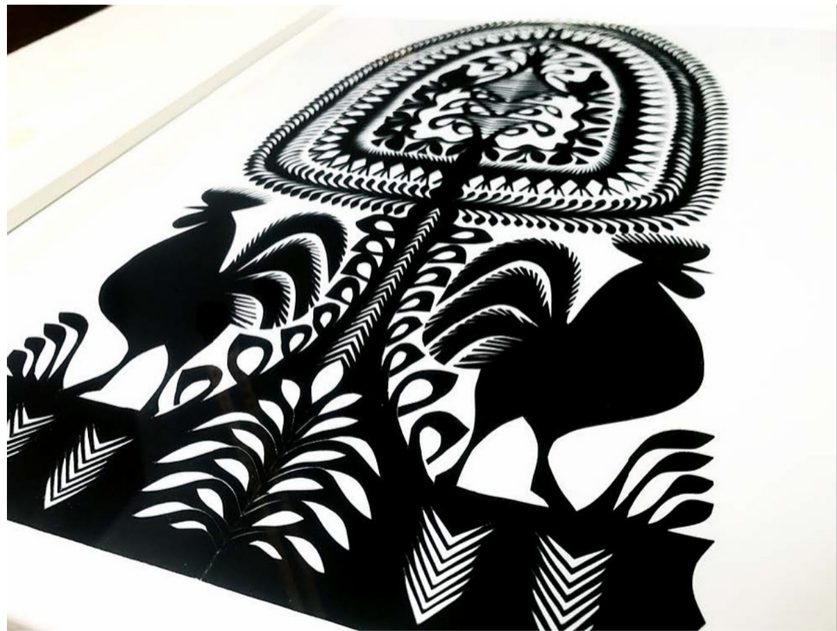
Traditional Kurpie cutout

There are many beasts, animals and monsters in art brut – I encourage you to do your own search and find your own “art brut spirit animal”. I can guarantee it will be a unique guardian or an ally!