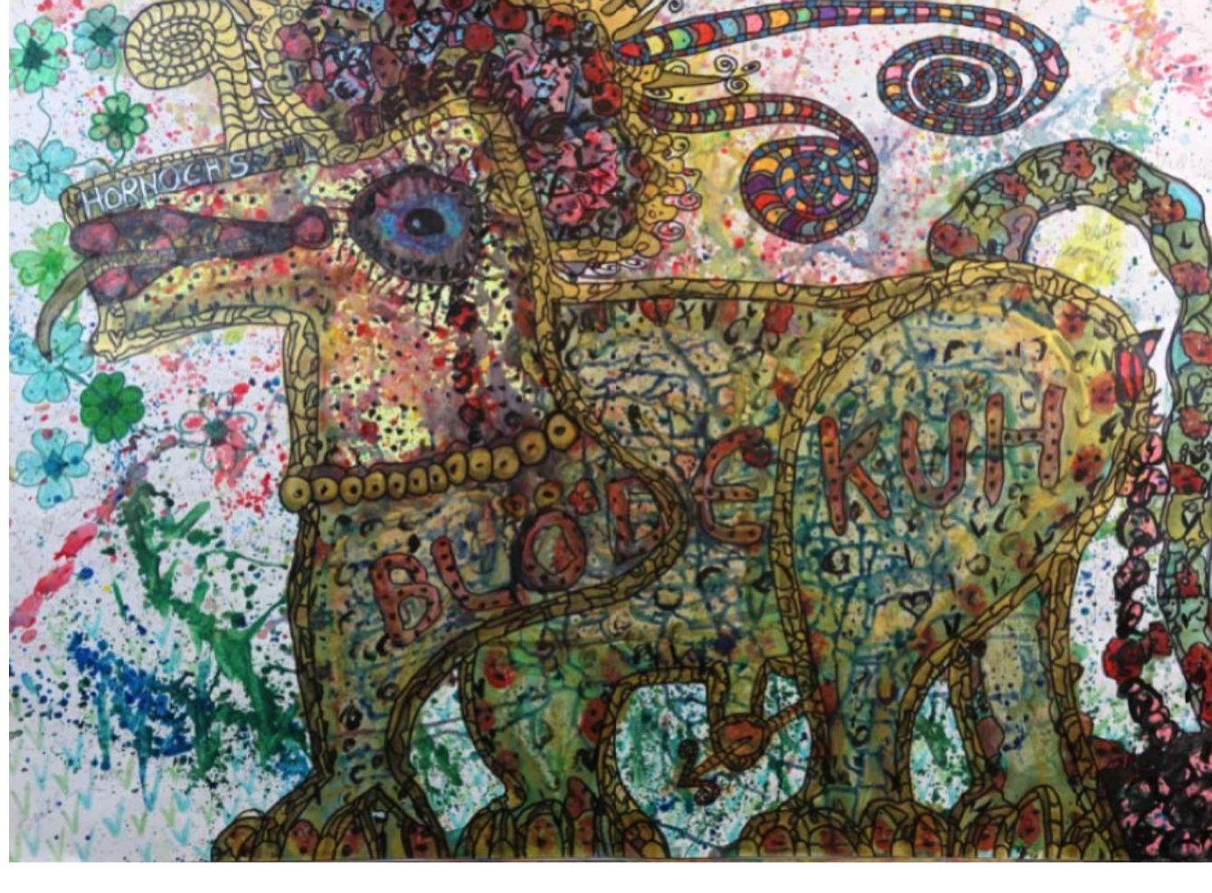
Madeline Mollet, No title, 2019

Drawn as if by a child, naive and dreamy – these are how animals in art brut are often portrayed. Mythical creatures, non-existing beasts, sometimes human friends like dogs, cats or horses; other times wild animals. Seldom bearing resemblance to how they look naturally; colourful, in motion, mosaic-style drawn or sculpted seem to be coming from another fantastic realm or long-forgotten fairy tale. Art brut presents a real Bestiary and invites all art lovers to get acquainted with creatures living in artists' imagination.